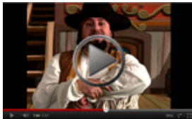
Jake and the Never Land Pirate Band as seen on Disney Junior

The sounds of the season will be performed by top musical artists at The Magnificent Mile Lights Festival presented by BMO Harris Bank on Saturday, November 19. See the latest additions: