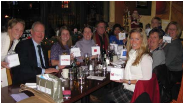
GNMAA Staff, enjoying new member restaurant Mario's Gold Coast Ristorante, at their 2008 Holiday Party.