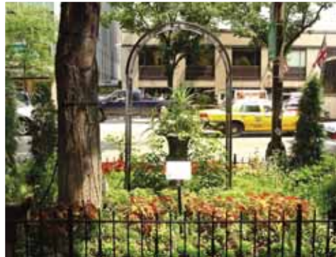
626 N. Michigan Avenue

Managed by Water Tower Realty, this well-maintained property pleased judges with its stunning garden, healthy trees, water features and spotless sidewalks. Moore Landscapes helped bring the garden to life in elegant fashion.