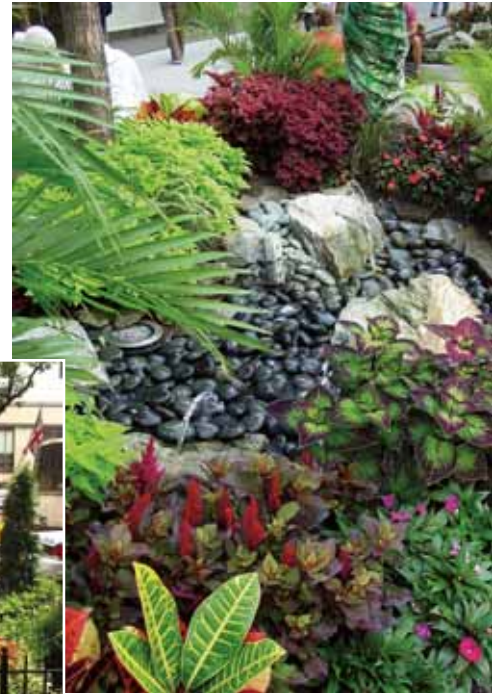
679 N. Michigan Avenue