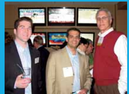
Members had fun at Stretch Run for a recent Membership Connection.