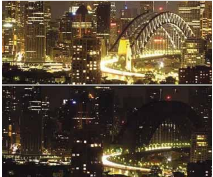
Earth Hour - Sydney, Australia 2007