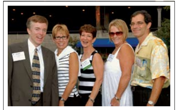
This photo was taken at the 2007 Annual Boat Cruise

The Program Division is busy planning the Annual Golf Outing and the June Membership Luncheon. See page 9 for more information!