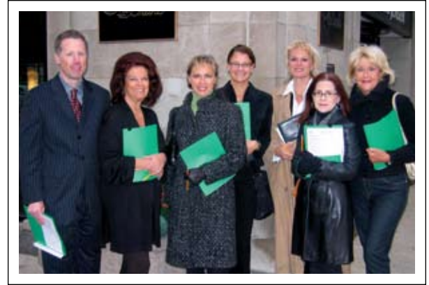
This photo was taken of the Public Way Committee during the 2007 Fall Beautification Walk.

The P&A Division creates value for businesses and institutions in The Magnificent Mile area by protecting and enhancing the physical, social and economic environments and advocating on behalf of GNMAA members. The division has committees focusing on transportation, security, the public way, signage, sustainable gardens, and advocacy. Overall, the division is responsible for the wellness of the physical aspect of the avenue.