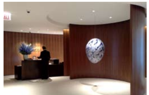
This photo was taken of a lobby within the Chicago Spire.