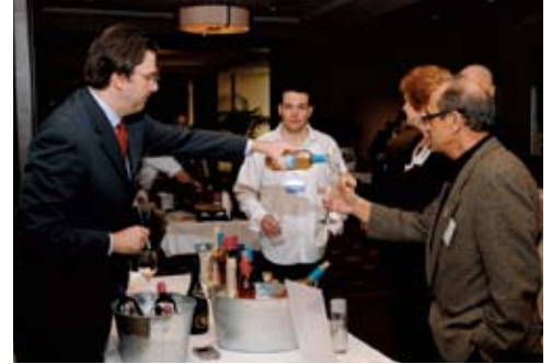
GNMAA members are sampling one of the many delicious wines at the event at Trump.