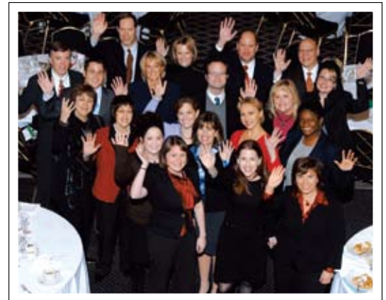
This photo of the Membership Committee was taken at the December 2007 Luncheon

We can always use more help! If you like working on relationships or selling membership, come and help us boost membership and networking within the association.