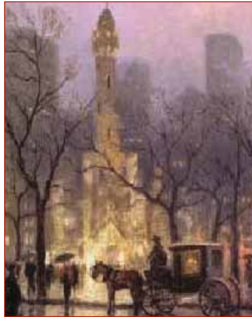
The Magnificent Mile