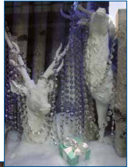
Above: Tiffany & Co. Winner, Best In Show

Earlier in the day, a panel of 11 younger judges chose the Kid's Choice! award through a collaborative effort with John G. Shedd Aquarium, Jenner Elementary School, and William B. Ogden School. This group of kids visited the Shedd Aquarium prior to tending to their official judging duties to learn how to evaluate window displays. Selected by their teachers because of good grades or attendance, each student earned the opportunity to be a judge for this contest.