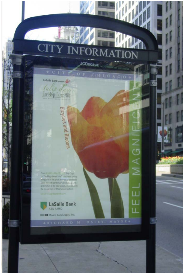
City Information Panels on North Michigan Avenue

Radio, print and on-line local and regional advertising programs, including Chicago Magazine, 101.9fm THEMIX , newspaper inserts and via city, retail, hotel and other member partners.