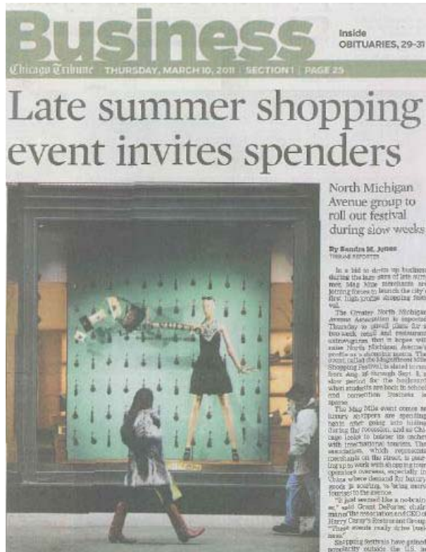
March 10, 2011 Release of Shopping Festival ChicagoTribune