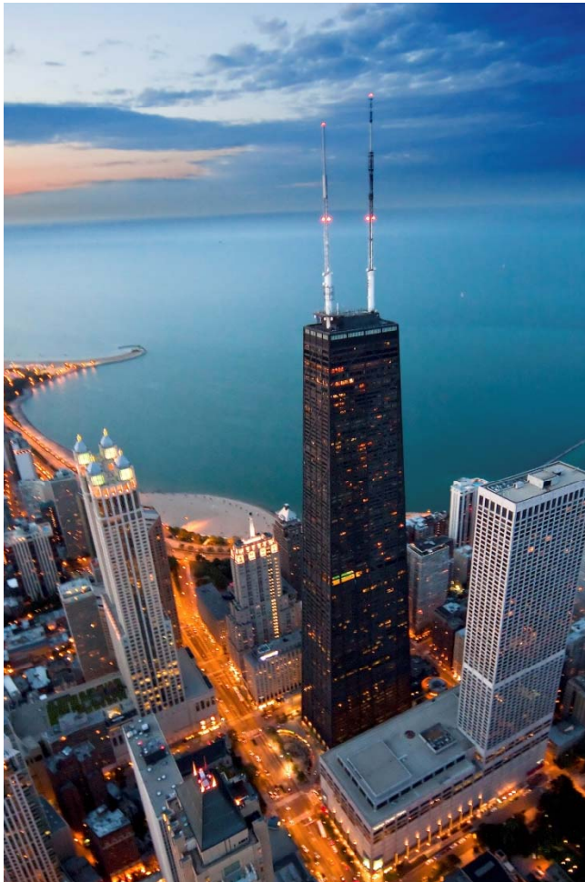
Aerial view of Michigan Avenue and Lake Michigan