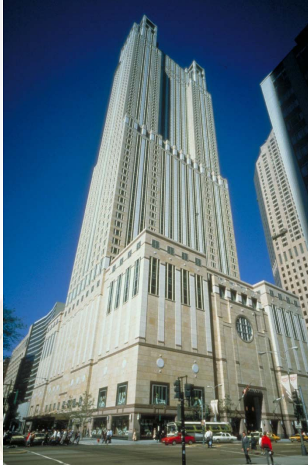
Exterior of 900 North Michigan Shops, one of three vertical shopping centers